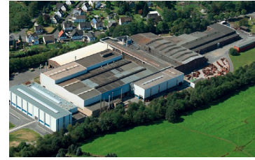
Werk II, Foundry Waldstraße 52, 57250 Netphen, Germany

Coming from A45 North Recommended for Trucks and Cars Take Exit Siegen