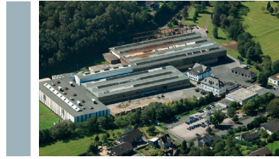
Werk I, Machine Shop Huettengeweg 5, 57250 Netphen, Germany